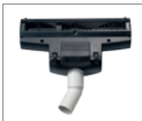
Turbo Brush: Bottom view

Ideal for cleaning of carpets and rugs. It's square edges allow access to the most difficult areas to clean. The roller brush speeds up with airflow and dislodges dirt or dust. A must have for carpet floors.