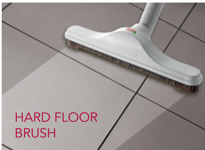
HARD FLOOR BRUSH

Premier Clean provide complete cleaning solutions for your home. We offer a wide range of ducted vacuum tools and accessories for carpet, hard floor and tiled surfaces.