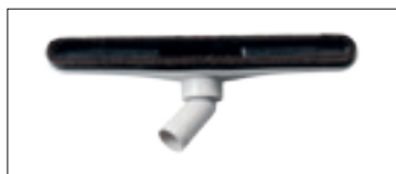
Hard Floor Brush: Bottom view

This has soft bristles which prevents damage to floors and cleans thoroughly. A must have for any home that has large areas of wooden or tiled floors. Available in 10 or 14 inch sizes.