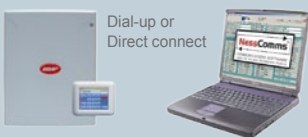
Optional programming by NessComms software*