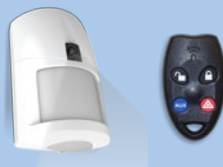
Wide range of optional Ness Radio Accessories