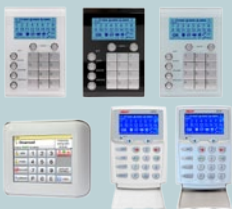
Wide choice of keypads