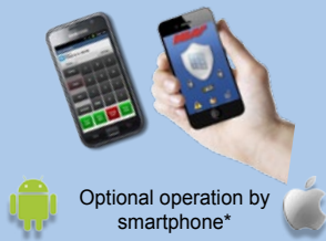
Optional operation by smartphone*