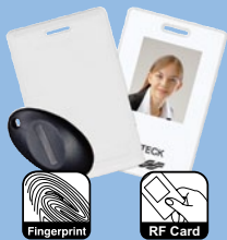
Onboard Access Control